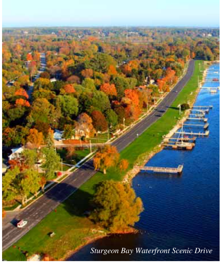
Sturgeon Bay Waterfront Scenic Drive

3 digit security code on reverse of card _____