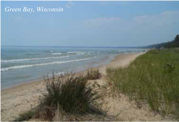
Green Bay, Wisconsin

Day Two. Today includes Heritage Hill State Historical Park, an open-air museum containing more than 30 historical structures, Afterwards, we will proceed toward the Shrine of Our Lady of Good Help near New Franken. Later in the afternoon, we visit a local brewery, Tiletown Brewing Company for a tour and dinner. BLD